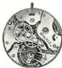
cal. 520 S seconde au centre