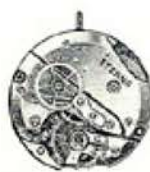
cal. 1025 S seconde au centre